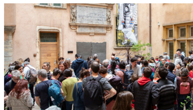
Great Investigation 2024 © Slowicki