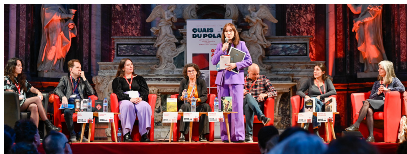
Literary award ceremony

Thousands of internet pages (sites, blogs...)