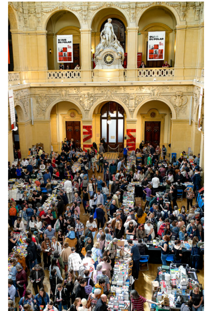
Great Noir Bookshop in the Palais de la Bourse