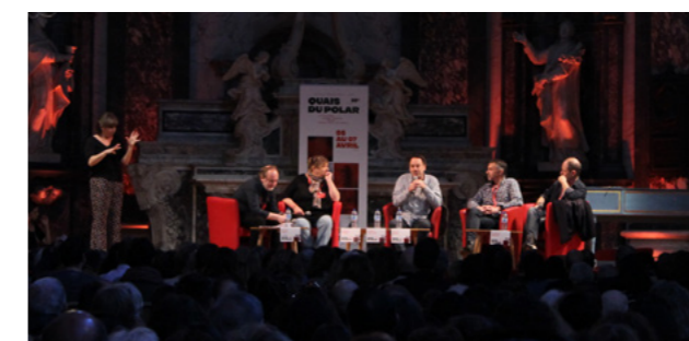
Meeting translated into FSL © Laura Belli-Riz