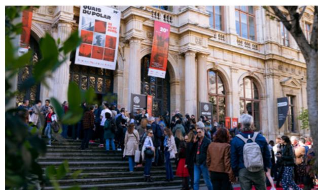
Palais de la Bourse

Friday 4 April | 2 p.m. > 7 p.m. Saturday 5 April | 10 a.m. > 8 p.m. Sunday 6 April | 10 a.m. > 6 p.m.